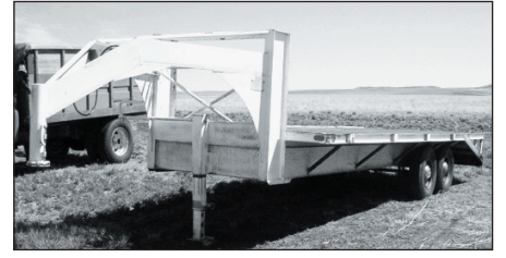
1975 Hanover Gooseneck, 8 ft. by 20ft. steel floor flatbed trailer w/ tandem axle

Homemade licensed 2 wheel trailer 175 Yamaha Enduro motorcycle 440 Massey Ferguson snowmobile Long box pickup topper, white w/ lots of windows, probably fits Chevy 80-90's Pickup toolbox, one side 3500 watt power plant w/ Briggs engine, on wheels Electric rock tumbler