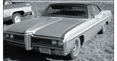
1968 green Pontiac Catalina car, new paint, only 40,000 miles, Vin#252398X101826

1977 GMC 1 ton dually 2-wd, 454 V8 engine, 4 spd. trans., and steel flatbed w/ 5 th wheel 1977 GMC 4x4 1/2 ton Pkup w/ 4 spd. trans., and runs on propane 1980 Chevy pickup 1/2 ton 2 wd w/ auto trans., runs on propane, 119,584 miles 1979 GMC pickup 15 Sierra Grande w/ auto trans. 1979 Chevy pickup, 2-wd, 350 gas engine w/ auto trans. 1969 IHC 1200 4X4 pkup, only 44,000 miles