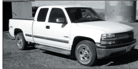
2001 Chevy white 1500 pickup w/ extended cab, w/ 4 doors, 4.8 liter Vortec V8 engine, w/auto trans., 4x4, 6 ft. box w/ tonneau cover, only 32,000 miles