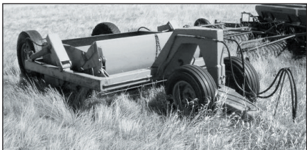
600 Crown 80 inch belly dump scraper, S#0756

Electric drive cement mixer Wheelbarrow 100 gal. pickup gas tank w/ hand pump Portable hydraulic system run w/ gas engine Onan 2 cylinder engine Trailer axles