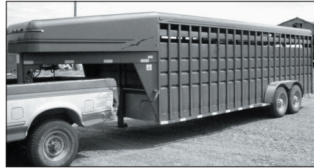
2002 Travelong Gooseneck Stock Trailer, 22 ft. of bed, Mt. Heavyweight Bull package, 3 compartments, gates swing & slide, very good condition, blue color.