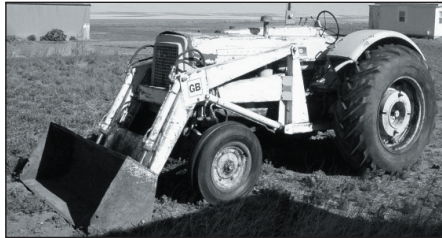
570 Cockshutt Tractor w/ GB front end loader

600 Case Tractor, runs on propane, live PTO, has been used on the hay grinder. S#8100650. Factory 4 wheel header trailer 6"X 43 ft. grain auger w/ Wisconsin engine