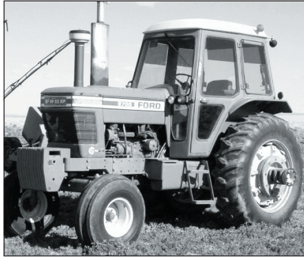
1979 Ford Tractor, model 9700 with 2470 hrs. 135 PTO HP, has live PTO and 18.4x38 rear tires with set of duals