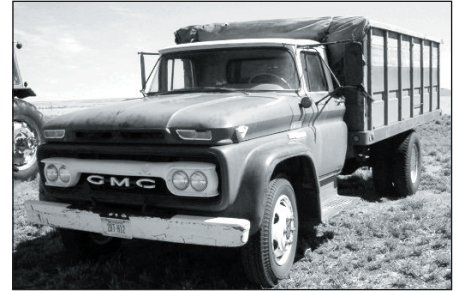
1962 GMC 1.5 Ton grain truck w/ V6 engine, 15 ft. box & hoist, 50,000 miles

1977 GMC 1 ton dually 2-wd, 454 V8 engine, 4 spd. trans., and steel flatbed w/ 5 th wheel 1977 GMC 4x4 1/2 ton Pkup w/ 4 spd. trans., and runs on propane 1980 Chevy pickup 1/2 ton 2 wd w/ auto trans., runs on propane, 119,584 miles 1979 GMC pickup 15 Sierra Grande w/ auto trans. 1979 Chevy pickup, 2-wd, 350 gas engine w/ auto trans. 1969 IHC 1200 4X4 pkup, only 44,000 miles