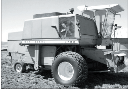
7700 John Deere Combine with gas engine, 24 ft. straight cut header. Combine has 2830 hrs. on it.