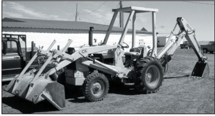
1970 Case Construction King Industrial Tractor w/Backhoe. Front end loader w/ wide bucket, model 580CK, S#8663630. Has gas 4 cylinder engine